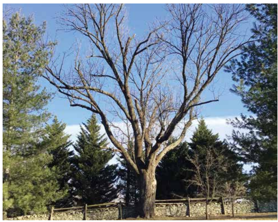
Since it has been treated for the emerald ash borer, this old, storm-battered ash tree near Unison will be leafing out this coming spring. It was probably a young tree during the Roaring 20s a hundred years ago and hopefully will be seeing many more springs to come. Some ash can live 250 years or more, at least they could before the emerald ash borer hit.

Woodpeckers love to feast on emerald ash borer, accounting for maybe 35-40 percent the insects mortality, according to a US Agricultural Department (USDA) report.<sup>5</sup> The same article also discusses USDA research on biocontrol experiments. The main focus of this effort has been a parasitoid