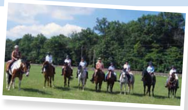
Above: The FaBuLs get set to ride on neighborhood trails.

Jane: You bet we do. It is common sense. We ride on trails that we help maintain for various hunts and we ride on farms where we have permission to do so. If you don't have that permission, you shouldn't be crossing other people's land. Neighborhood riding groups help make sure that we all stay good neighbors. That's an important function we play.