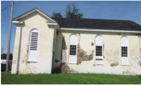
The Johnston Chapel, built in 1857, was decommissioned in mid-20th century and became a threshing barn, but is now being restored.

Johnston Chapel—is just north of the intersection of Bloomfield and Airmont Roads on Old Chapel Farm. It was built as a Methodist Chapel in 1857 and decommissioned in the mid-20th century to become a threshing barn for orchard grass production. Much of the architectural features were removed including the choir loft, windows and center chandelier. The wood floor was replaced with cement. The original wall paintings remain, however. They are by well-known artist, Lucien Powell, whose work hangs in the National Gallery and Corcoran Gallery in Washington DC. The chapel is now undergoing a long-term renovation.