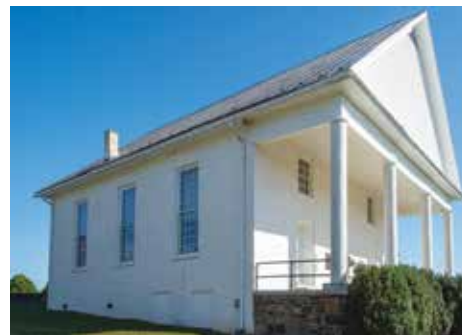
The old Ebenezer Church (left), built circa 1750, and the new Ebenezer Church (right), built circa 1850, standing within a few feet of each other reflects a split in the Baptist congregation in Bloomfield in 1834.