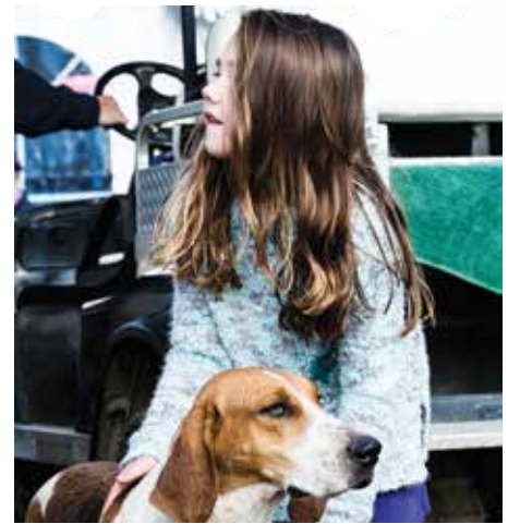
Hang out with the Piedmont Hounds.