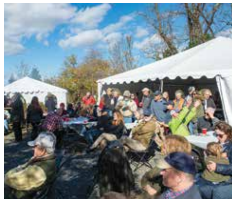
Catch up with neighbors and friends and enjoy bluegrass music by Willow Grass.

Tickets are $35 in advance, $40 at the door. Request tickets, donations and sponsorships at www.unisonva.org or by mail at P.O. Box 606, Middleburg, VA 20118. Your name will be on a list at the door on Friday and/or Saturday. We hope to see you there!